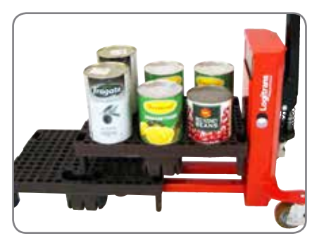
LogiQ 660 can handle the upper quarter pallet without problems.