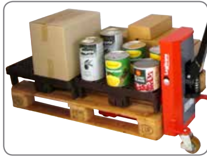
A quarter pallet is lifted from a EUR pallet with LogiQ 660 and can be moved to the location of display in the shop.